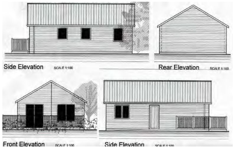
Figure 4 Proposed elevations